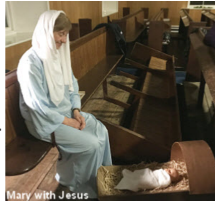
Mary with Jesus