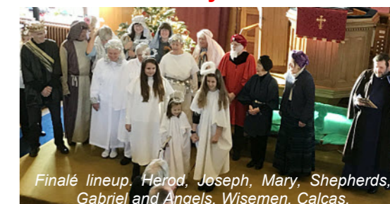
Finalé lineup, Herod, Joseph, Mary, Shepherds, Gabriel and Angels, Wisemen, Calcas.

We catch up with Mary and Joseph in the stable, there being no room at the inn. Baby Jesus is born in a manger. The shepherds arrive to see the new born Messiah, offering their modest gifts. The shepherds left and spread the word all around Bethlehem that night.