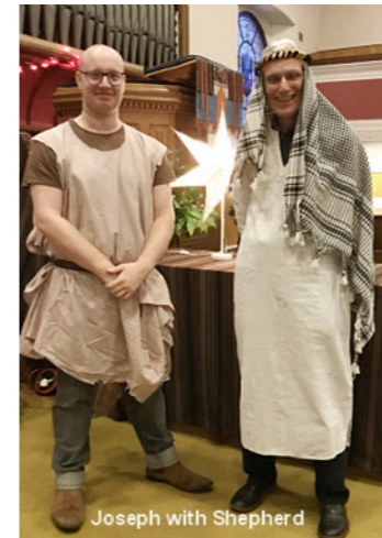
Joseph with Shepherd