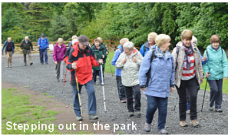
Stepping out in the park

This years walk was around Dalkeith Country Park, last visited on a walk back in 2014. We met up with friends from Roslin, that we see often on these walks. The park has changed a lot in the past four years, with more facilities for families with young children, walkers and cyclists.