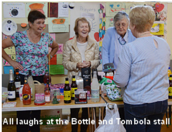
All laughs at the Bottle and Tombola stall