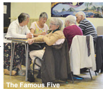
The Famous Five

After three categories we had tea/coffee and loaf and cake. Then back to the quiz.