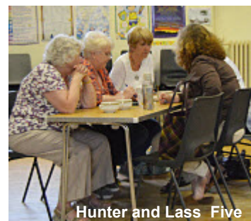
Hunter and Lass Five