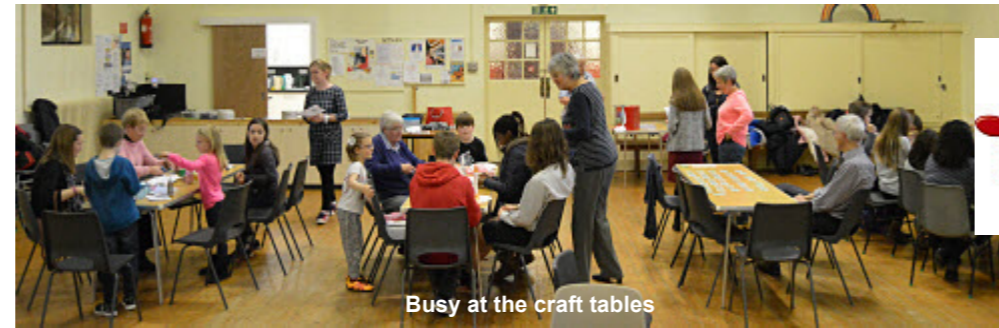
Busy at the craft tables