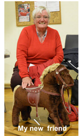
My new friend

When the final five minutes was called there was a rush to try and make sure yours was the final bid. It certainly was not a SILENT auction then as everyone stood poised waiting for the final whistle. Most people managed to get what they wanted but there were a few disappointments.