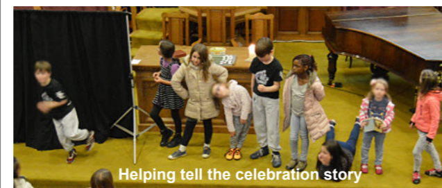
Helping tell the celebration story

Prayer Station - A feature of all our Messy Church afternoons. A map of the world, with pictures and information about where our natural resources are running out, and lists of endangered animals and plants, encouraged everyone to pray for the world. Do we unknowingly help to destroy the world? What do we already do to help?