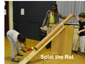
Splat the Rat

Splat the Rat - This was a fun activity. We waited for the rat to emerge from the rat run, the pipe. We talked about patience, being prepared and waiting.