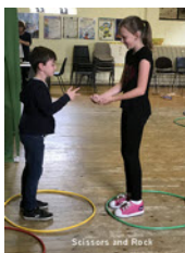
Scissors and Rock