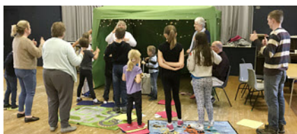
Song time with signing actions