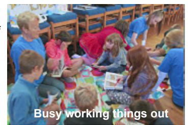
Busy working things out

Please continue praying for everyone who attended the holiday club and if you know of any children who might like to download such a fun way to learn about the