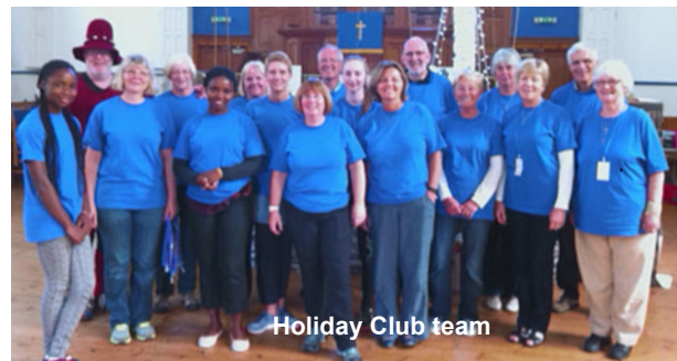
Holiday Club team

The DVD shown in church recently showed how much fun the children and the leaders had as the quests were fulfilled each day. As always there were snacks, games, craft and group-learning times where the children were encouraged to ask questions.