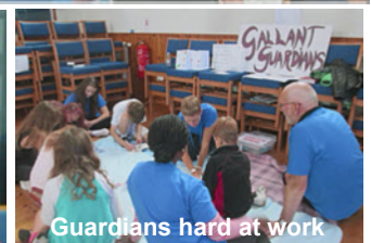
Guardians hard at work